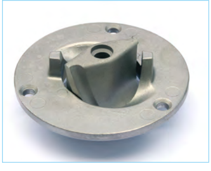
Hardened stainless-steel cutters (HRC 55) in the GRP series