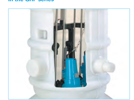
Packaged submersible pump stations with sythetic sump (Type SKB) and GRP pumps