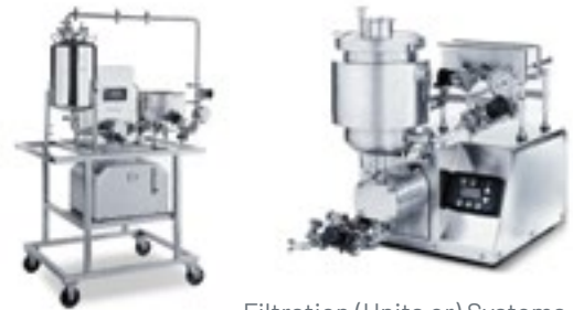
Filtration (Units or) Systems

LABTOP features a compact and highly mobile design perfect for filtration, chromatography, pilot applications, R&D and more. LABTOP makes your pumping activities simple and efficient. Each LABTOP is composed of a Unibloc pump, a motor and controller enclosed in a stainless-steel canopy, with bidirectional flow for versatility. Unibloc offers three versions of the LABTOP: the 200 Series, the 300 Series and the 400 Series.